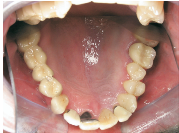
Fig. 5. Ipsilateral pallor of hard palate.

The patient was discharged after 48 hours and asked to continue with the aspirin and steroids for a further 5 days. At 1 week review the patient still experienced chronic pain in the left anterior maxillary region, which now showed increased bruising. The mucosa on the left hard palate was still pale and several areas of superficial