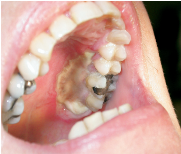
Fig. 3. Palatal ulceration at 2 weeks.