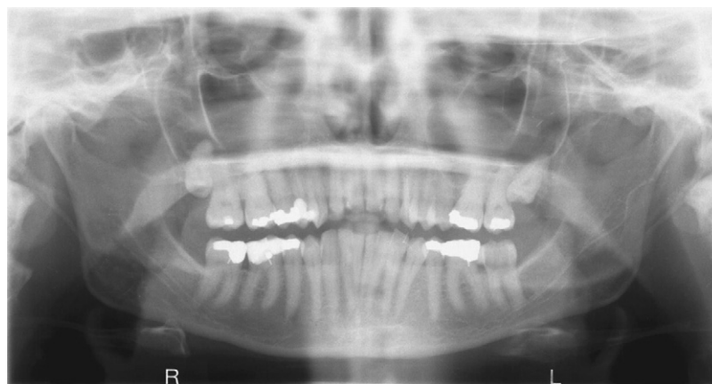
Fig. 2. Orthopantomogram showing radiopaque material in the left inferior alveolar canal.

Plain radiographs revealed an arteriogram appearance with radiopaque material within the confines of