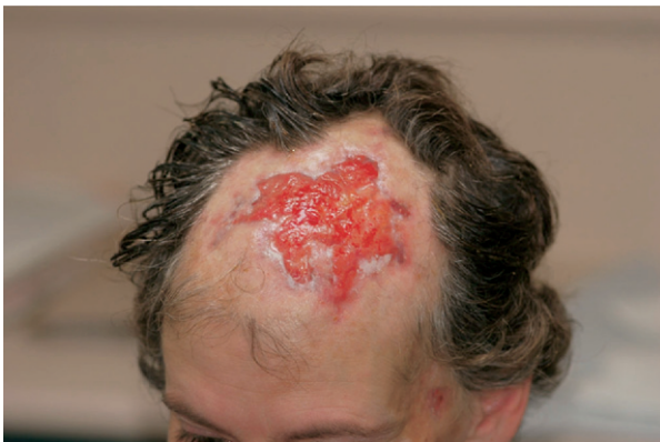
Fig. 4. Widespread loss of full thickness scalp following debridement.

the posterior superior alveolar artery and the infra-orbital artery. Foreign material could not be detected within the greater palatine artery despite the clinical appearances. A computerized tomography (CT) scan with 3-dimensional (3-D) reconstruction confirmed the distribution of the material (Fig. 6).