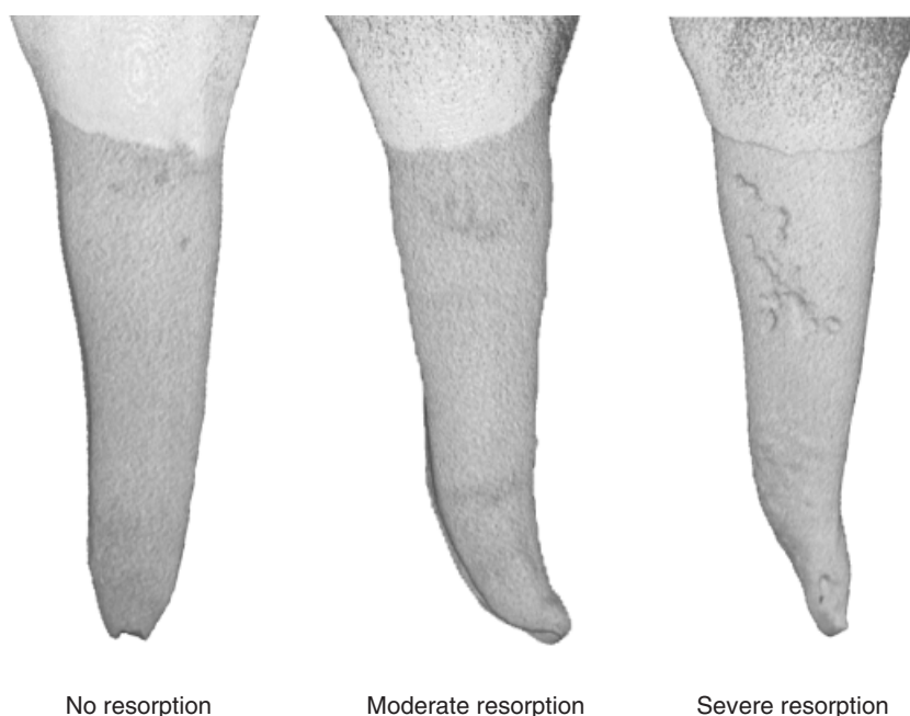
Fig. 2. Presence or absence and severity of cervical root resorption evaluated by two calibrated examiners in one experimental and two control pre-molars of one patient: the first control pre-molar shows no resorption; the second control pre-molar shows moderate resorption; and the third experimental pre-molar shows severe resorption.