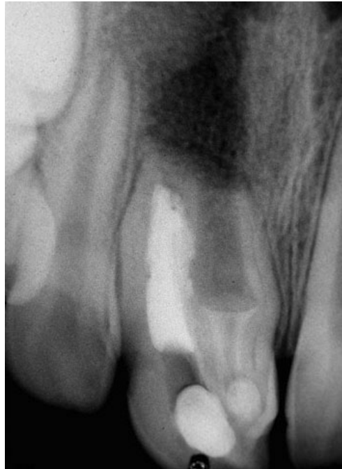
Figure 3 Periapical radiograph immediately after main canal filling and calcium hydroxide treatment for pseudo canal apexification.