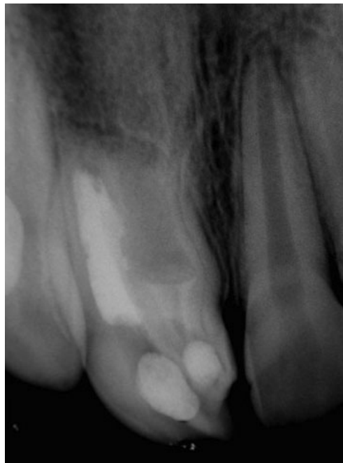
Figure 4 Periapical radiograph shows healing of the periapical lesion, but no evidence of hard tissue barrier was found.

inadequate root filling with poor apical adaptation. Surgical access followed at the same appointment and a triangular flap was raised before removing the extruded root filling material. An immature root apex with defective dentine walls was revealed and its surface