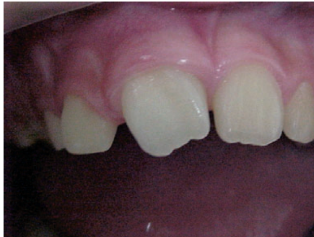
Figure 2 Clinical signs of morphological alteration in the maxillary right central incisor.

The pseudocanal was filled with calcium hydroxide and an apexification treatment was initiated (Fig. 3). The calcium hydroxide dressing was renewed every month for 1 year and although there was radiographic evidence of healing, no hard tissue barrier was formed. The patient failed to attend for 2 years, and when a follow-up periapical radiograph was taken, it revealed no hard tissue barrier formation (Fig. 4). A decision was made at this stage to complete treatment by a combined nonsurgical and surgical approach.