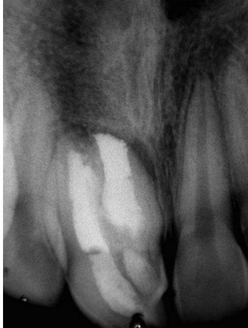
Figure 5 A 4-year follow-up periapical radiograph.

was corrected with appropriate ultrasonic tips, a zinc oxide cement (IRM) was placed into the root-end cavity. The flap was sutured for 7 days; an antibiotic (Amoxicillin 250 mg each 8 h for 7 days; Medley S/A Indústria Farmacêutica, Campinas, Brazil), analgesic (Paracetamol 500 mg, 6/6 h.s. for 2 days; Janssen-Cilag Farmacêutica, São José dos Campos, Brazil) and 2% chlorhexidine mouth rinse were prescribed.