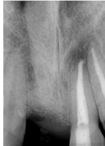
Fig. 8. Follow-up radiograph taken 18 months following decoronation.

At the age of 17.5 years, about two and a half years after decoronation and before his admission to