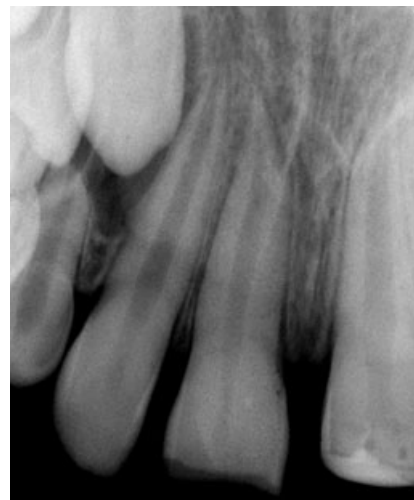
Fig. 1. Periapical radiograph of maxillary right central incisor immediately after replantation.

A 15-year-old boy presented to the pediatric dental clinic at the School of Dental Medicine, Hebrew University with a complaint of a non-esthetic maxillary right central incisor position. His medical history included the presence of an allergy to penicillin and a heart murmur with regurgitation that required antibiotic prophylaxis prior to dental intervention. Dental history revealed that at the age of nine, during gymnastic training at school, he fell and both maxillary central incisors were traumatized. Based on the patient's records, the injury caused the avulsion of his maxillary right central incisor combined with an uncomplicated crown fracture and sub-luxation of the maxillary left central incisor accompanied by a complicated crown fracture. The avulsed tooth was left in dry extraoral conditions for 90 min prior to being treated by a professional dental provider. The emergency treatment included rinsing the root and socket of the maxillary right central incisor with saline solution prior to replantation (Fig. 1). The