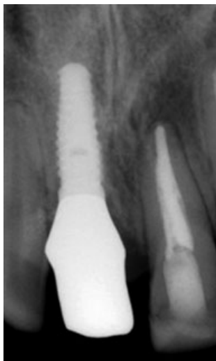
Fig. 13. Radiograph of the implant and final restoration.