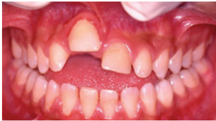
Fig. 2. Clinical photograph of infra-positioned maxillary right central incisor 6 years following trauma.

Radiographical examination showed replacement root resorption of the maxillary right central incisor with evidence of an undeveloped alveolar ridge (Fig. 3). The periapical tissues surrounding the maxillary left central and lateral incisors were in a