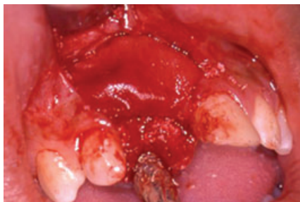
Fig. 7. Collagen membrane (Bio-Gide) covering Bio-Oss particles.