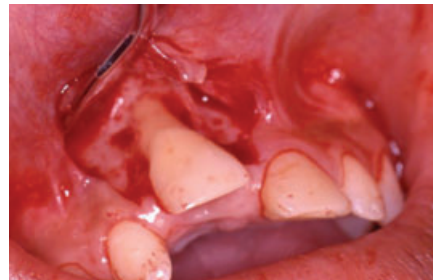
Fig. 4. Full thickness mucoperiosteal flap elevation exposing the ankylosed tooth.

The surgical procedure was performed after obtaining parental consent. The patient was given antibiotic prophylaxis (600 mg clindamycin, Dalacin C; Upjohn, Puurs, Belgium) 1 h prior to treatment. Following administration of local anesthesia, an intrasulcular incision around the treated tooth with mesial and distal sub-marginal releasing incisions was performed to avoid the interproximal papillae. A full-thickness buccal mucoperiosteal flap was elevated exposing the tooth and the labial cortical plate (Fig. 4). The palatal tissue was left intact. The crown was decoronated and the root canal filling removed. The root canal was then alternately instrumented and rinsed with saline until bleeding from the surrounding tissues filled the empty root canal (Fig. 5). This step is critical, as the blood clot will decrease the risk of infection and allow the ingress of osteoclasts and osteoblasts, thus