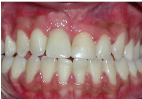
Fig. 12. Final implant supported restoration.