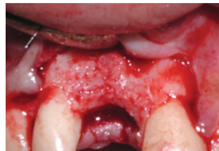
Fig. 10. Clinical view of alveolar ridge prior to implant insertion to replace the maxillary right central incisor.