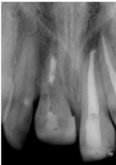
Fig. 3. Radiograph of ankylosed maxillary right central incisor.

process of healing without evidence of root resorption. The adjacent teeth were asymptomatic and responded normally to thermal and electric pulp stimuli. A diagnosis of replacement root resorption of the maxillary right central incisor was made and the patient was referred to a multidisciplinary team of specialists for evaluation and treatment planning.