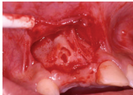
Fig. 5. Decoronated root canal filled with blood.