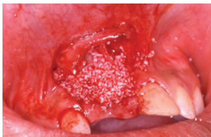
Fig. 6. Bone graft (Bio-Oss) applied on top of decoronated root to augment alveolar bone deficiency.