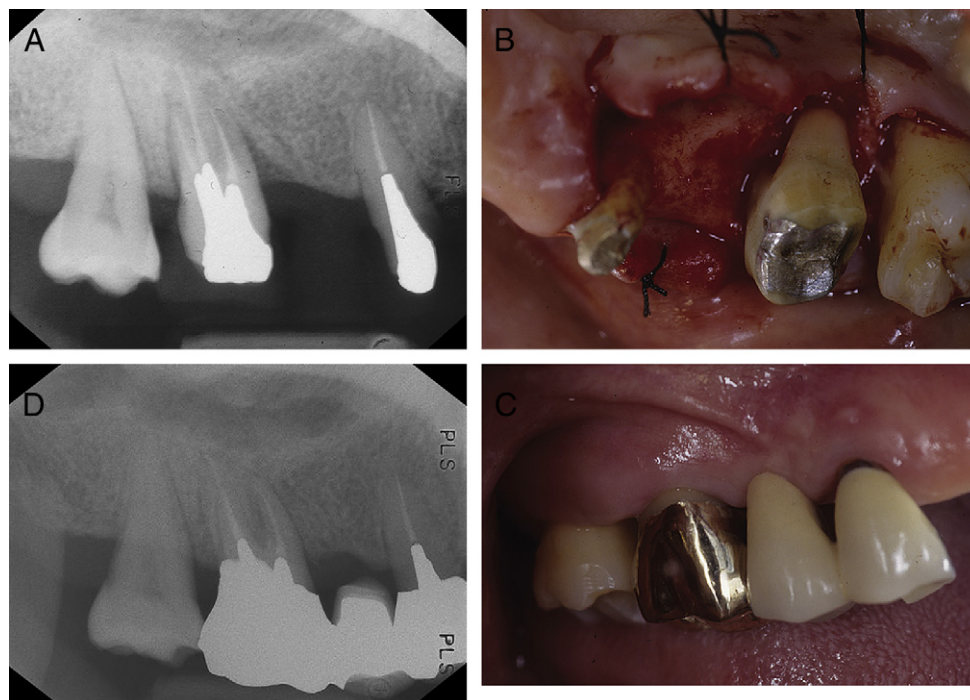
Figure 2. (A) Ten-month follow-up radiograph after the first GTR procedure. (B) Remaining bony defect at 10-month re-entry surgery. (C) Final prosthesis delivered 5 months later. (D) Ten-month follow-up radiograph after the second GTR procedure.

Regeneration” AND “Endodontic.” Hand searching included a perusal of bibliographies of relevant articles and review articles. A total of 14 articles with 26 cases were found, demonstrating the successful management of endodontic-periodontal lesion(s) with the concomitant regenerative procedures (3, 9, 16–27). Table 1 summarizes the reported endodontic-periodontal lesions classified by the classification of Simon et al (2), tooth type, arch location, and bone destruction patterns. Of 26 cases, 17 cases involved teeth in the maxilla, and 9 cases involved teeth in the mandible. Most cases reported involved single-rooted teeth: maxillary incisors (30.8%), maxillary premolars (23.1%), and mandibular incisors (23.1%). Very few cases involving mandibular premolars were reported (3.8%). A total of 19 cases reported involved both periapical lesions with concomitant marginal bone loss.