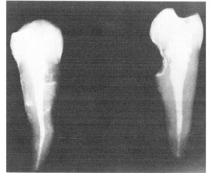
Fig 2—Radiograph of premolar shows outline of root canal before instrumentation. Left, faciolingual view, right, mesiodistal view.

After biomechanical preparation, each tooth was radiographed both from mesiodistal and buccolingual angles. The radiographs were evaluated independently by three clinicians with the following criteria used: 2 desig-