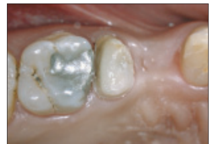
Figure 6: Bonded composite post-core build-up before crown preparation refinement.

2 appointments are necessary, and the cost is high. Even in clinical situations with an important loss of internal dentin — traditionally restored with a custom-cast post and core — there has been more success when the tooth is restored with bonded resin composite reinforced by a smaller central metal post. 6 Many commercially available prefabricated posts, including esthetic posts, are now available. Different clinical conditions require careful patient-specific treatment planning. Figure 6 shows the bonded composite core build-up before refinement of the crown preparation. ♦