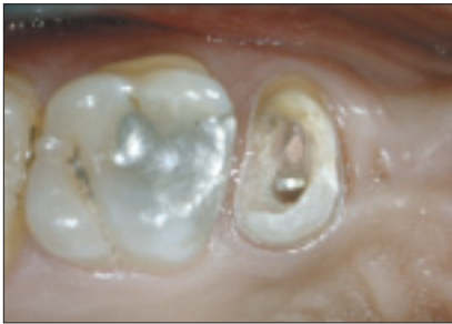
Figure 4: Initial crown preparation with removal of all restorative materials within the crown. Trial placement of prefabricated metal post in palatal canal.