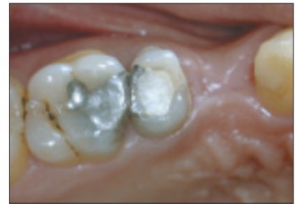
Figure 3: Occlusal view showing extent of occlusal and distal tooth loss.