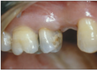
Figure 1: Facial view of a successfully endodontically treated maxillary bicuspid.