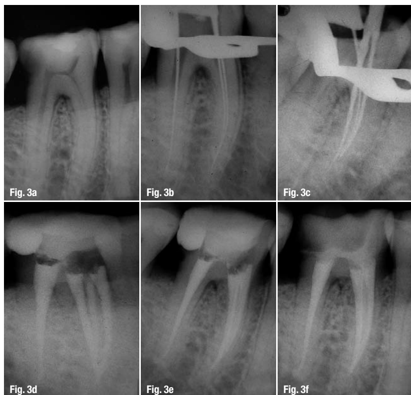
Figs. 3a-f _ Root-canal treatment on an MFM: pre-op radiograph (Fig. 3a); working length radiograph (Fig. 3b); working length off-angle radiograph after location of three canals on mesial root (Fig. 3c); post-op, off-angle radiograph demonstrating three canals treated on mesial root (Fig. 3d); post-op, ortho-radial radiograph (Fig. 3e); final restoration control (Fig. 3f).

Several publications report the presence of three canals in the mesial root. 40,41 Our systematic review reports an incidence of 2.6% (Figs. 2 & 3). 17 In order to localise it, access modifications are required. Briefly, once the main canals have been localised and their access instrumented, small burs or ultrasonic tips are used to remove the dentinal bridge that connects both entries, providing a direct view of the angle formed by the mesial wall and the floor of the pulp