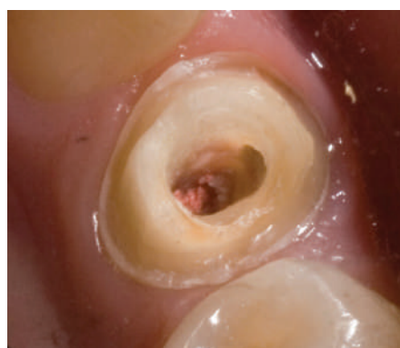
Fig. 2 Type A: No anticipated risk of mechanical failure

height of the remaining tooth structure are preserved. Clinical guidelines are suggested based on conclusions drawn from the review of current literature.