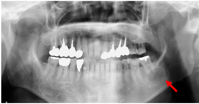
Figure 1. Radiologic findings: pantomography at the first referral. The red arrows indicate a radiolucent circular lesion at the apex of #18. There were also radiolucent lesions in the body of the right mandible below teeth #29 and #30.

oxaloacetic transaminase = 87 IU/L, glutamic pyruvic transaminase = 74 IU/L, gamma-glutamyl transpeptidase = 66 IU/L, and alpha-fetoprotein (AFP) = 346 IU/L. Tumor markers showed relatively high AFP and AFP-L3 (lectin 3) levels of 158.5 ng/mL and 41.1%, respectively.