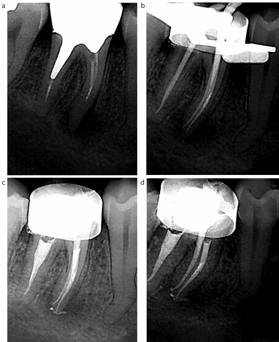
Figure 3. The fragment of spiral filler in the middle third of the mesio buccal root could not be removed. (a) It is by-passed, enabling the passage of endodontic files and fresh irrigant (b) to the apical root canal anatomy. The instrument has been embedded in the filling material (c, d).

doubt exists, patients should be referred for advice on management. Several approaches can be adopted: