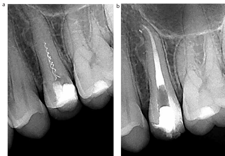
Figure 1. (a, b) The two fragments of a spiral filler fractured in the coronal third of the canal are an additional complication for retreatment of this tooth. The removal of these instruments makes it possible to shape, disinfect and fill the root canal conventionally.

The effect of instrument fracture on prognosis had been reported prior to the introduction of nickel titanium rotary