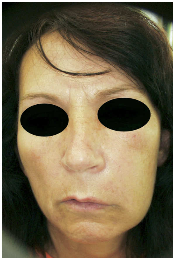
Fig. 2. The day after the accident. The left face side shows swelling from infraorbital to mandible. Only slight hematoma could be seen.

month later, the swelling had almost resolved, mouth opening was improved, and the patient was free of pain. On her own request the patient went to a neurologist because of persisting hyposensitivity and motor restriction. The neurologist found a paresthesia of the left facial nerve branch 3 and 4 with a nonsymmetric soft palate arch, an asymmetric mouth, and a hypotrophic left facial mimic musculature. The sensible arch of the trigeminal nerve was also altered infraorbitally on the left face side. The infraorbital nerve paresthesia was unchanged, and there was no improvement of the buccal branch facial nerve weakness.