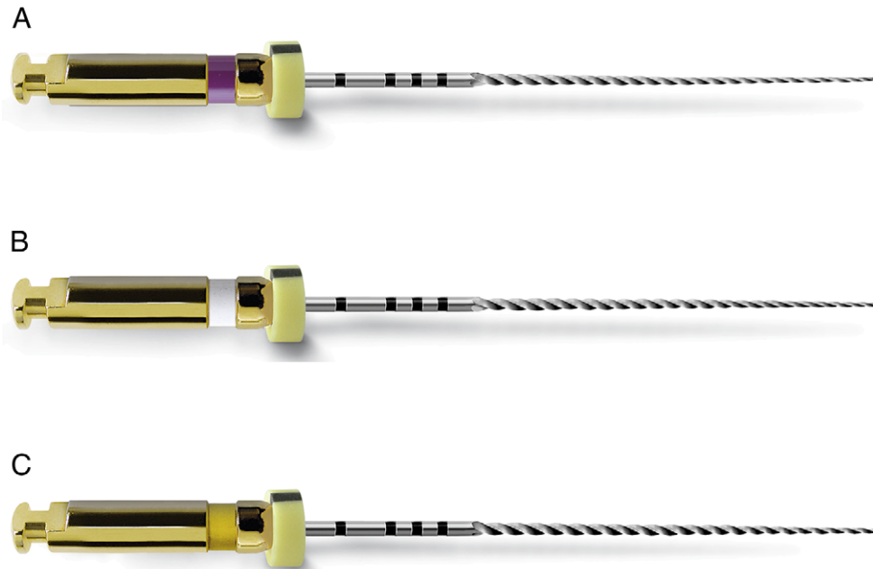
Figure 1. PathFile NiTi Rotary instruments. (A) No. 1, ISO 13 tip; (B) no. 2, ISO 16 tip; (C) no.3, ISO 19 tip.

In group 3 (mechanical preflaring–inexpert clinician), the same procedure as in group 1 was performed by an inexperienced clinician.