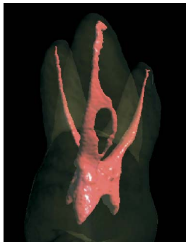
Figure 1. Mesiobuccal view of root canal system of a maxillary first molar (MB root is centered). (Reprinted with permission from Brown P, Herbranson E. Dental anatomy & 3D tooth atlas version 3.0. Illinois: Quintessence, 2005: Maxillary First Molars—3D Models 1. Unique Features.)