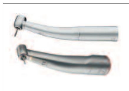
Figure 5—Sirona Dental Systems: T2 Racer (air) (top) and T1 C 200 L (electric) (bottom).