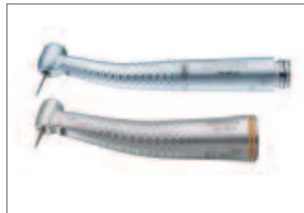
Figure 1—A-dec/W&H: Synea TA-98 LC (air) (top) and Synea WA-99 LT (electric) (bottom).

Two factors to understand and compare when shopping for a new high-speed handpiece are speed and torque.