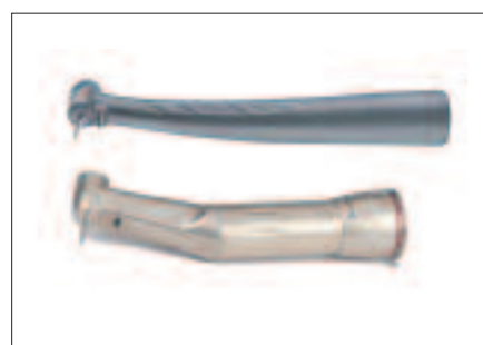
Figure 6—StarDental: Solara (air) (top) and Titan E-lectric (electric) (bottom).