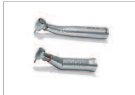
Figure 2—BienAir: Bora LK (air) (top) and CA 1:5 L (electric) (bottom).

Speed is expressed in revolutions per minute (rpm). Whereas, torque is expressed in watts (W) and is an indication of the handpieces' cutting power, air-driven high-speed handpieces typically will have speeds between 250,000 rpm and 420,000 rpm. Although, electric handpieces