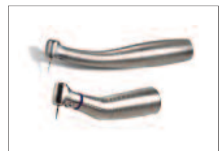
Figure 7—Dentsply Professional: Midwest Stylus (air) (top) and Midwest e-Stylus (electric) (bottom).