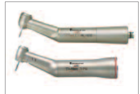
Figure 3—Brasseler USA/NSK: Ti-Max NL-95S (air) (top) and Ti-Max Ti95L (electric) (bottom).

Electric systems alternatively offer smooth, constant torque that does not vary as the bur meets resis-