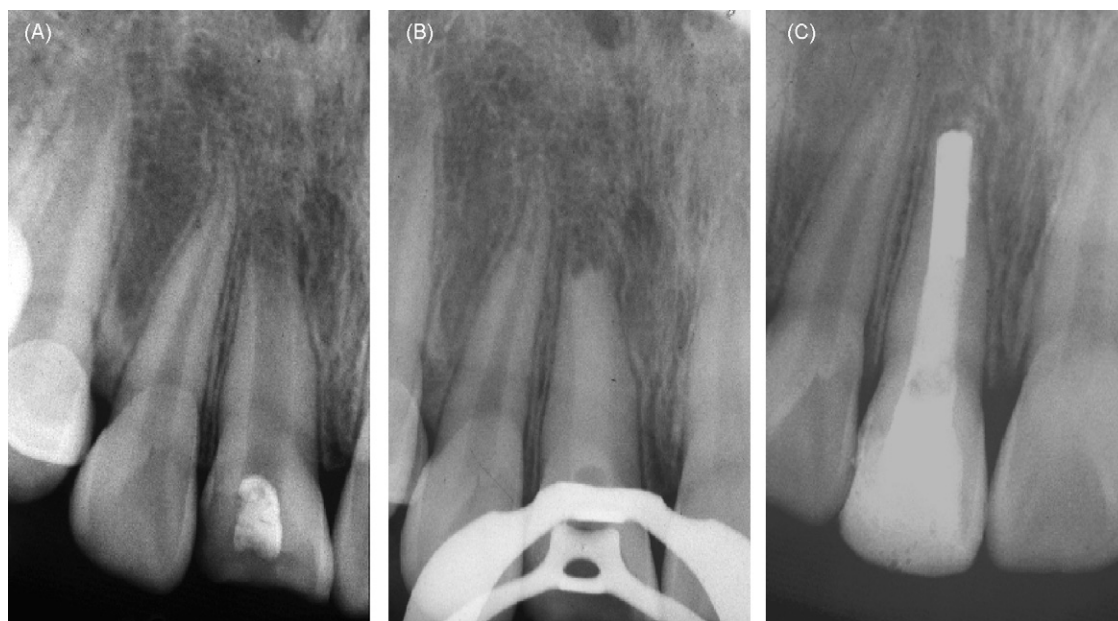
Fig. 1 – Traditional apexification with calcium hydroxide. (A) Tooth #8 of an 11-year old was tested non-vital with open apex. (B) The canal was cleaned and shaped and filled with calcium hydroxide every 3 months until an apical stop was detected. (C) The apical half of the canal was filled with gutta-percha and the remaining canal with composite (1 year after initial treatment).

to preserve the remaining vital tissue and to allow completion of root formation and apical maturation. 21–23 The second is the immature teeth with necrotic pulp. Apexification is then performed to treat immature teeth with non-vital pulp by inducing a calcific barrier at the open apex. 20,21 Teeth after apexogenesis with vital pulp therapy develop a normal thickness of dentin, root length and apical morphology, whereas teeth receiving apexification normally gain only an apical hard tissue bridge without a further development of the root (Fig. 1).