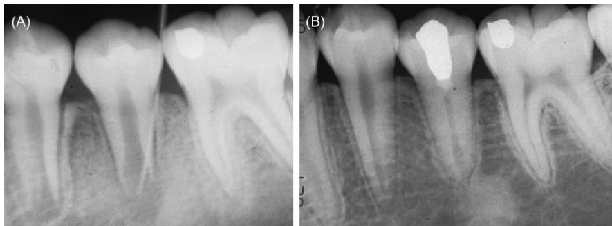
Fig. 3 – Clinical case of a 10-year-old patient. (A) Radiograph showing a radiolucent lesion at the periapical area of tooth #20 with a wide-open apex (a gutta-percha point into the sinus tract). (B) Thirty-five months after the initial treatment revealing a marked reduction of the root canal space and maturation of the root apex. The accessed cavity was filled with Cavition and amalgam. (Adapted from the original article with approval. 19 )

mentioned, the presence of radiolucency at the periradicular region can no longer be used as a determining factor, nor is the vitality test. In both situation, vital pulp tissue or apical papilla may still present in the canal and at the apex. Logically, any remnant of visible soft tissue that can be visualized under the microscope should give the clinician an incentive to take the conservative approach, even though the soft tissue may be purely granulation tissues. However, one cannot rule out the possibility that there are not any remaining pulp tissues in the very apical part of the canal only because it cannot be detected clinically.