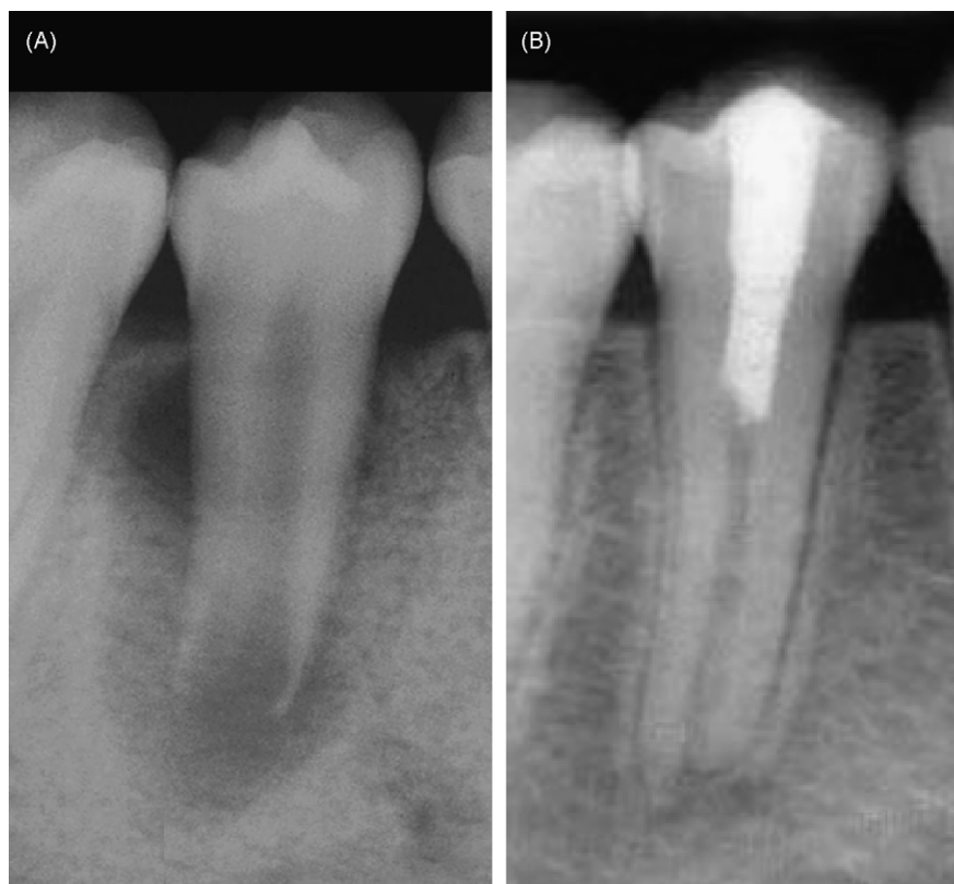
Fig. 4 – (A) Radiograph showing a lower premolar (#29) of an 11-year-old patient having an extensive periradicular lesion. (B) Twenty-four-month radiograph after treatment showing complete root development. (Adapted from the original article with approval. 25 )

Another obvious consideration is the duration of the infection. Hypothetically, the longer standing of an infected pulp in immature teeth there is the less survived pulp tissue and stem cells may remain. Additionally, the longer the infection there is in the canal, the more likelihood of a deeper penetration of microbial colonies into dentinal tubules that would occur, which renders the disinfection more difficult to accomplish.